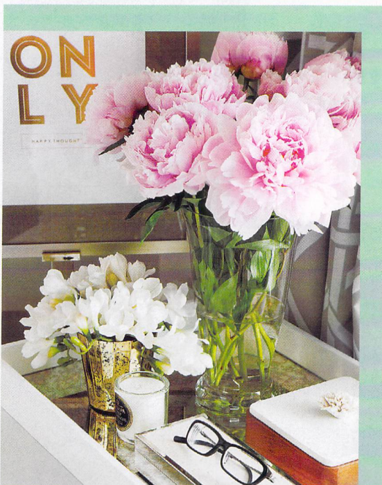
TABLE LAMP, HomeSense; white TRAY, SS Print Shop ARTWORK, Indigo.